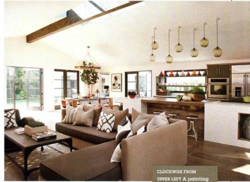
CLOCKWISE FROM UPPER LEFT A painting by Halverson Frazier hangs in the guest room; a view of the great room; landscaping by Garden Studio Design and Dig Landscape Construction.