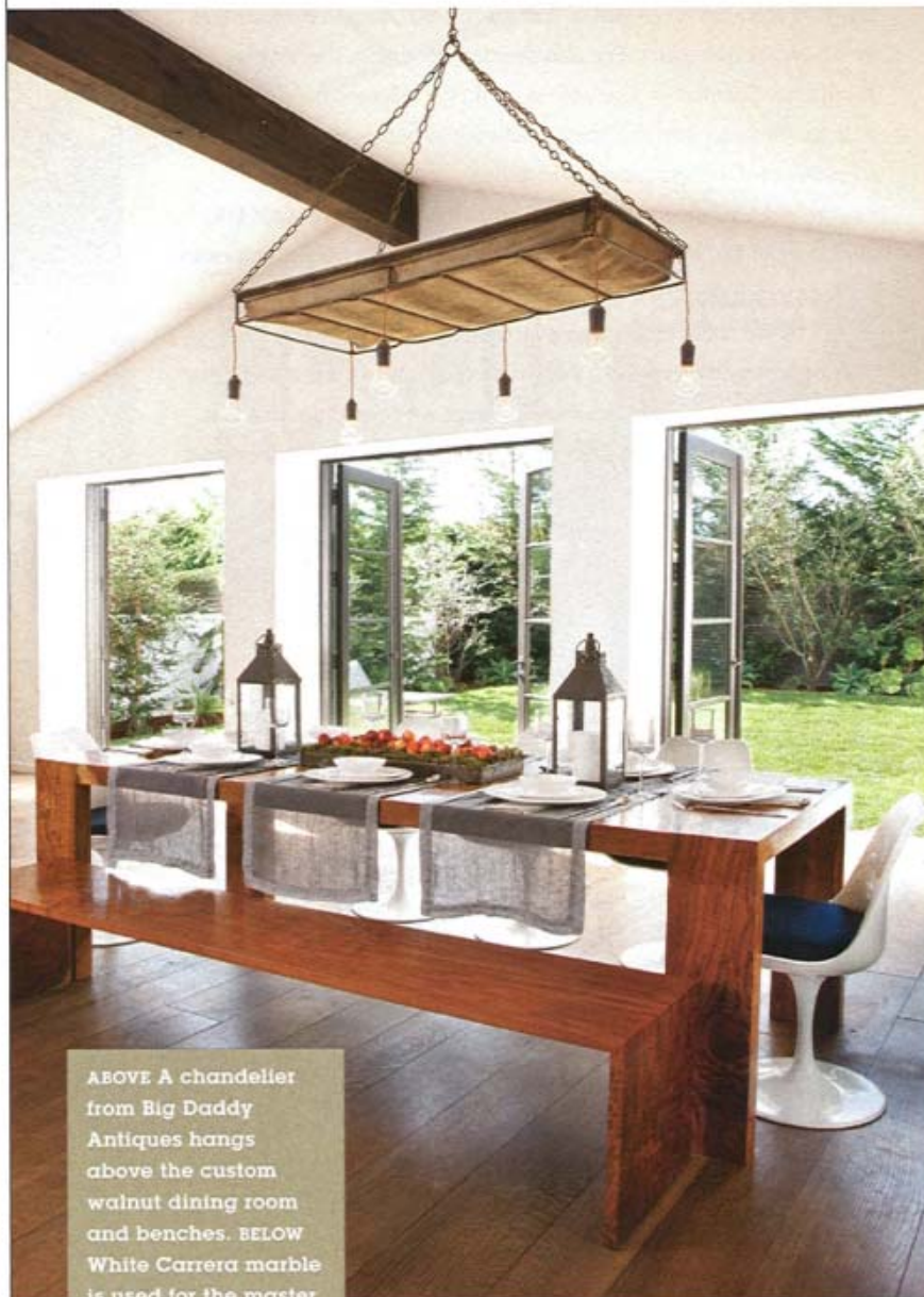
ABOVE A chandelier from Big Daddy Antiques hangs above the custom walnut dining room and benches. BELOW White Carrera marble is used for the master bath's tub. Paintings by Halverson Frazier.

If Eric was looking for a certain familial coziness, however, he didn't want the clutter that goes with it. Instead, he went for a less-is-more look, inside and out. "I worked Garden Studio Design, who ensured that the landscape was beautiful and harmonious with the sensibility of the house," he says. For the interiors, he warmed up the home's clean and contemporary lines with a series of rustic, organic-looking materials that give warmth and character while still keeping it streamlined. In